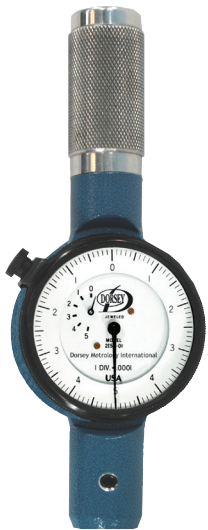
For .500" dia. shaft Part # Example: DS-2I50-01-2