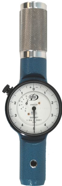
For .625" dia. shaft Part # Example: DS-2I50-01 Standard unit