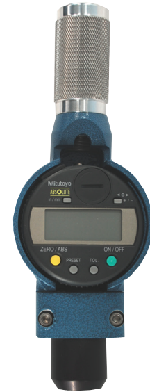
Digital or independent dial indicator housing Pt # DX4-81035 for most digital indicators