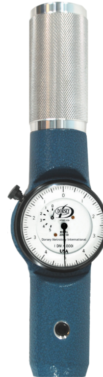
For 1" dia. shaft Part # Example: DS-2I50-01-6