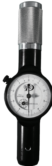
For .625" dia shaft Part # Example: DS-2DM025-01