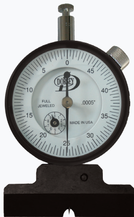
Shown is DDG-125C

Used to measure depths of small holes, engravings, rivets, or slots with extreme accuracy. Knife edge base with center cut permits unobstructed view of point for exact positioning.