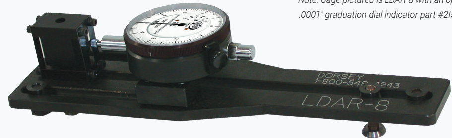
*Note: Gage pictured is LDAR-8 with an optional .0001" graduation dial indicator part #2150-01