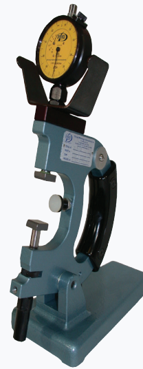
* Shown with #2110-002 indicator and optional #48502-S bench stand